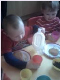
Preparing own snack

We have been discussing the importance of health and washing hands, brushing teeth and looking after ourselves. The children are becoming very independent in their self help skills and are more confident in carrying out their own tasks.