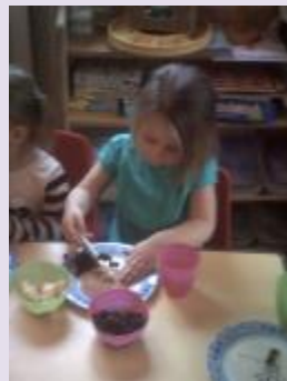
buttering own pancake