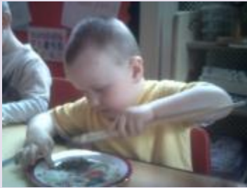
making chocolate leaves

They have also been focusing on the learning outcomes and experiences involved in science, which has provided the opportunity to carry out lots of science experiments.