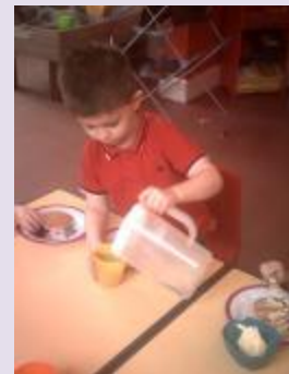
pouring own juice

If any parent would like to join our parents committee or receive information regarding this, please ask a member of staff.